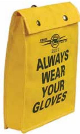
2211 8"L x 2"W x 12"H

Made of durable canvas duck, this glove bag features a hook & loop closure with a quick release snap.