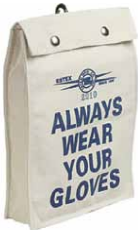
2210 8"L x 2"W x 12"H

Made of durable canvas duck, this glove bag features nickle plated snaps and a quick release snap.