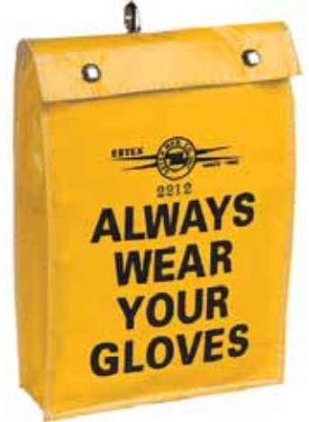
2212 8"L x 2"W x 12"H

Made of yellow canvas duck, this glove bag features nickle plated snaps and a quick release snap.