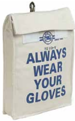
2210-V 8"L x 2"W x 12"H

Made of durable canvas duck, this glove bag features nickle plated snaps and a quick release snap.